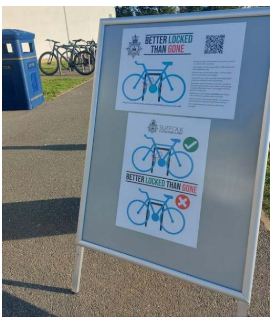
advice and also provide free security bike marking. I will also continue to distribute the dates and locations via Police Connect. To register for Police Connect please visit https://www.suffolk.police. uk/services/police-connect

'Street meets' in Lowestoft will continue throughout 2022 and I will announce dates when they are secured on both the Lowestoft police Twitter and Facebook pages. The 'street meets' are an ideal opportunity for you to come and have a chat with us, as we offer crime reduction